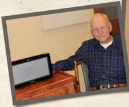
Donated Speaker System for Aspen Room

WHILE A LARGE PORTION OF OUR FUNDING THIS YEAR WENT TO ENHANCEMENTS AT THE COURTYARD - WE SUCCESSFULLY FUNDED THESE ADDITIONAL PROJECTS, TOO!