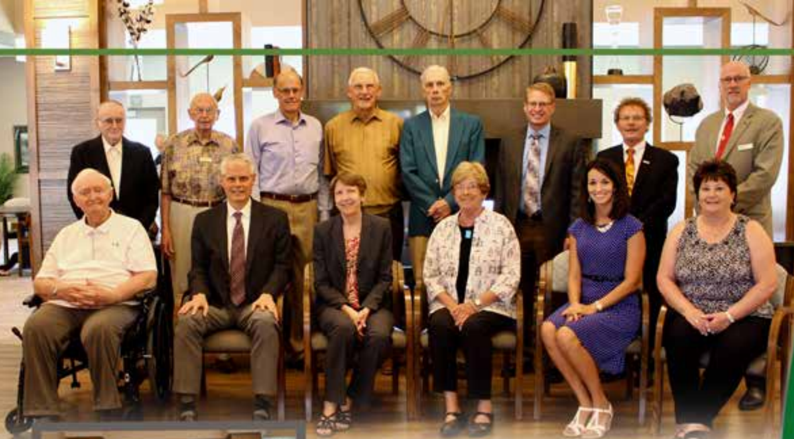
PAST & PRESENT BOARD OF DIRECTORS