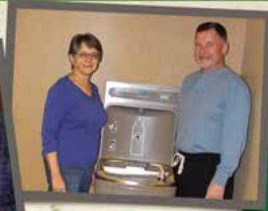
Donated Water Bottle Refill Station